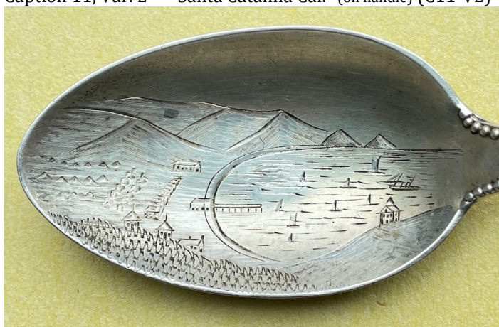
on Howard Sterling Co. Washington pattern (1895) tea – mono "1900"